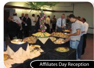
Affiliates Day Reception