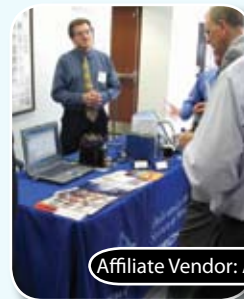
Affiliate Vendor: Aerotech, INC

For additional information on the Industrial Affiliates Program at CREOL & FPCE, The College of Optics and Photonics, visit the Affiliates web site.